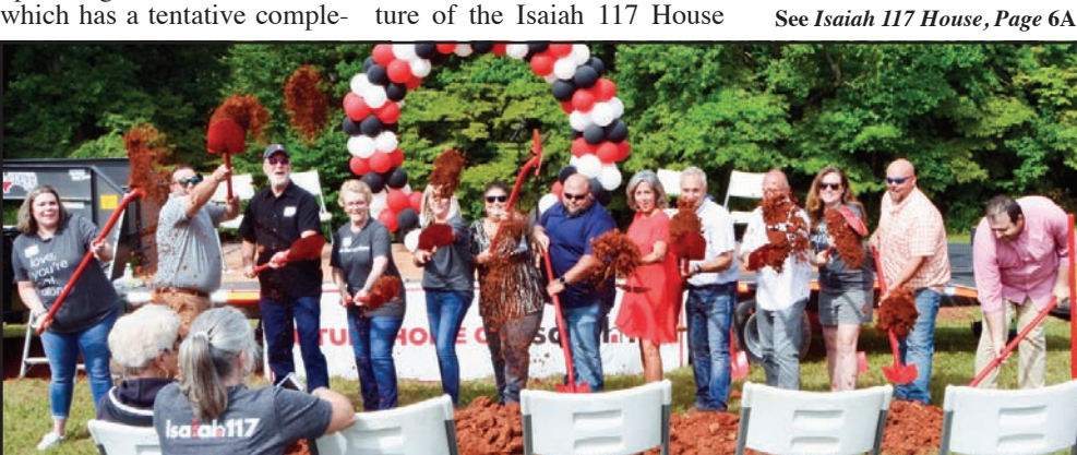
Stakeholders of the Isaiah 117 House effort celebrated last week's groundbreaking by tossing some dirt at the site of the future facility.

up and running, with children See Isaiah 117 House, Page 6A