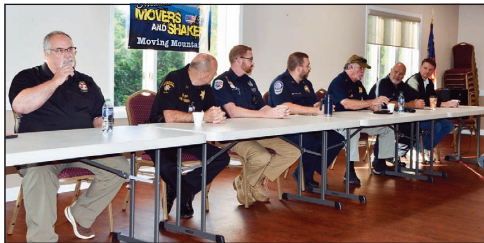
The Movers & Shakers forum on July 14 was a "who's who" of local public safety.