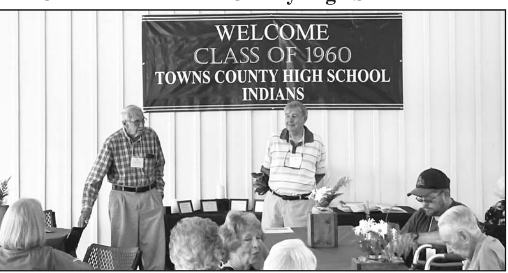
The Towns County High School Class of 1960 Reunion

The Towns County High School Class of 1960 finally got to have our 60 year class reunion (62nd) at the beautiful Hamilton Gardens in the Georgia Mountain Fair-