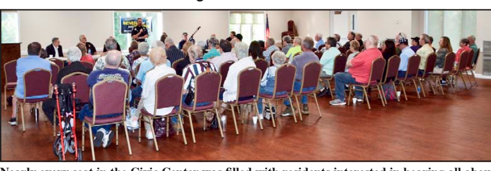
Nearly every seat in the Civic Center was filled with residents interested in hearing all about public safety in the Movers & Shakers forum on Friday.

"We are always continuing to learn and think about what we can do better to protect everyone here, and I want to thank everyone for being the kind of community that truly cares about one another," he concluded.